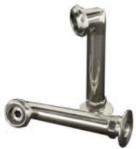
6" Elbow Mounts