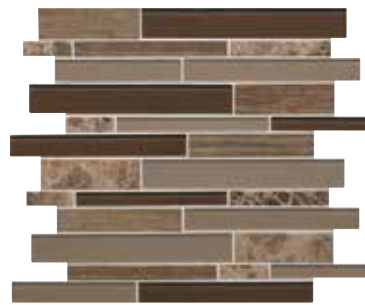
RUSTIC EVE IB03