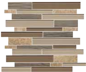
SYLVAN SUNSET IB02