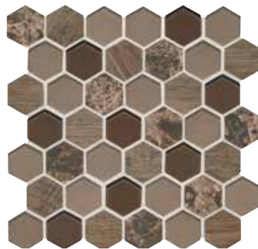
RUSTIC EVE IB03