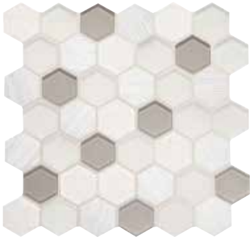
TRANQUIL SNOW IB01