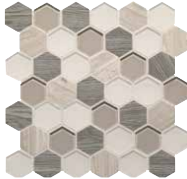
SERENE STORM IB04