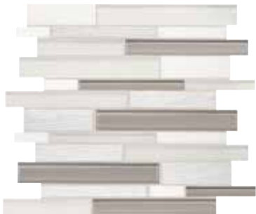
TRANQUIL SNOW IB01