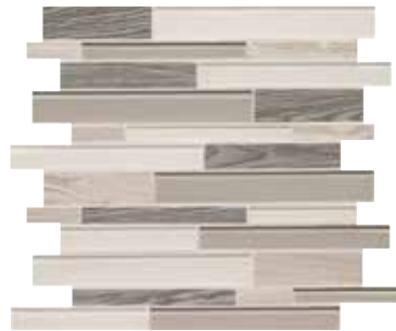
SERENE STORM IB04