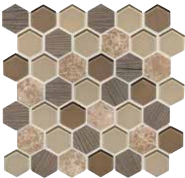
SYLVAN SUNSET IB02