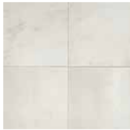
WHITE ASH MH04