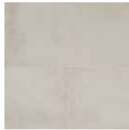
CHIMNEY CORNER MH06