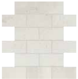
WHITE ASH MH04