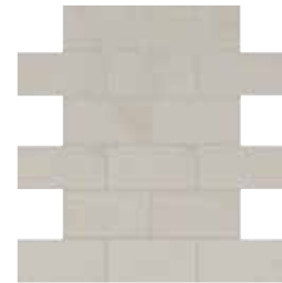
CHIMNEY CORNER MH06