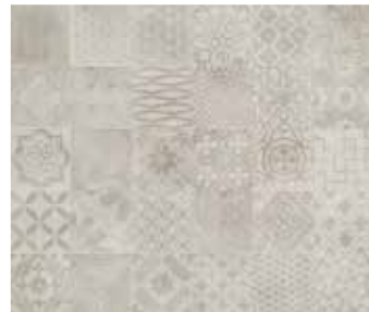
CHIMNEY CORNER MH09