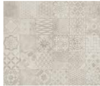
WHITE ASH MH07