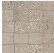
NATURAL GREY MU32