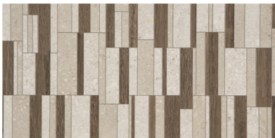
BLOCK WHITE MIX MU36