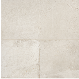
EXHIBITION WHITE MU30