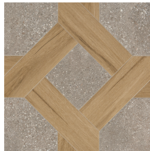
NATURAL GREY TRELLIS MU35