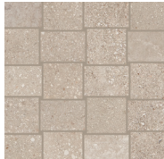
ARTISTIC GREY MU31