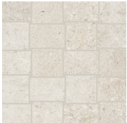
EXHIBITION WHITE MU30