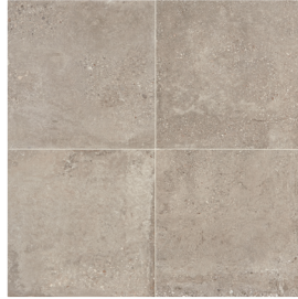
NATURAL GREY MU32