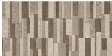
BLOCK GREY MIX MU37