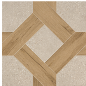
ARTISTIC GREY TRELLIS MU34