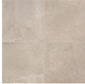
ARTISTIC GREY MU31