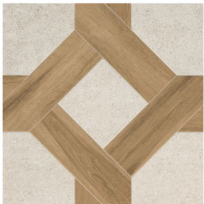
EXHIBITION WHITE TRELLIS MU33