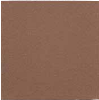
RED OQ90 (1)