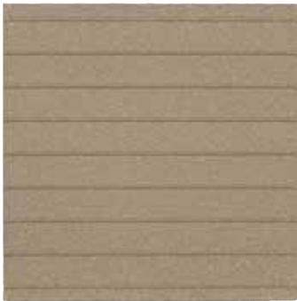
BEIGE OQ94 (2)