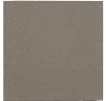
CHARCOAL OQ96 (2)