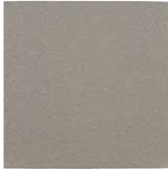
GRAY OQ92 (2)