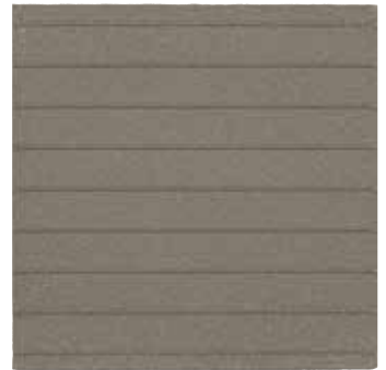
CHARCOAL OQ96 (2)

(1) and (2) indicate price groups, (1) being the least expensive.