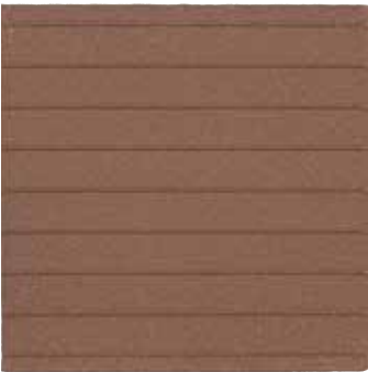
RED OQ90 (1)