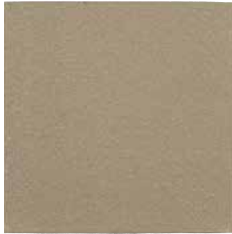
BEIGE OQ94 (2)