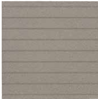
GRAY OQ92 (2)