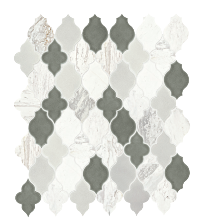
STRATUS WHITE BLEND DA40 Arabesque Mosaic – Honed