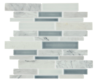
CIRRUS STORM BLEND DA35 Linear Random Mosaic – Polished