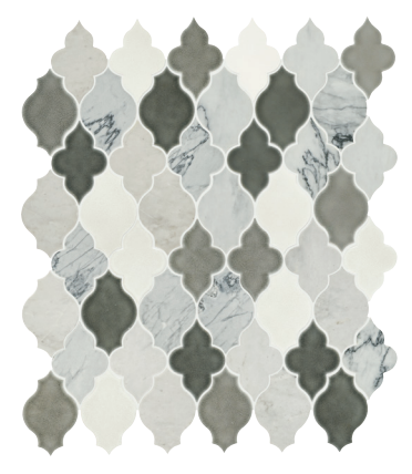
CIRRUS STORM BLEND DA41 Arabesque Mosaic – Honed