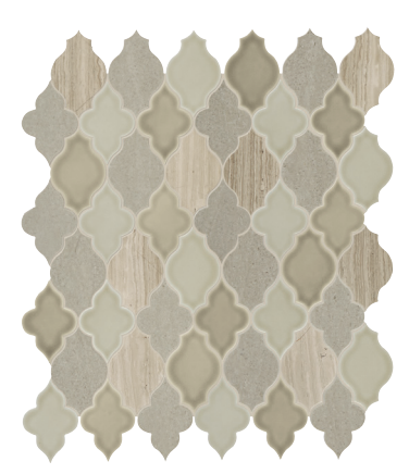
CUMULUS GREY BLEND DA42 Arabesque Mosaic – Polished