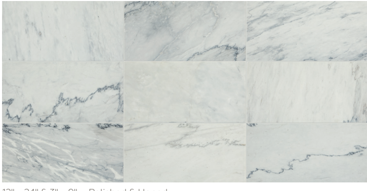
12" x 24" & 3" x 9" - Polished & Honed