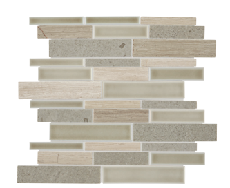
CUMULUS GREY BLEND DA36 Linear Random Mosaic – Polished