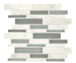
STRATUS WHITE BLEND DA34 Linear Random Mosaic – Polished