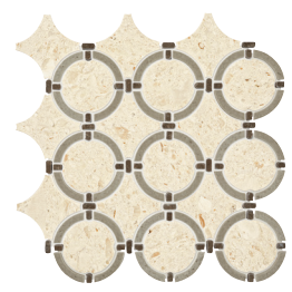
CUMULUS GREY BLEND DA39 Linked Ring Mosaic –