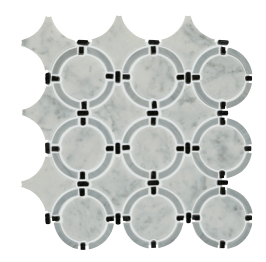
CIRRUS STORM BLEND DA38 Linked Ring Mosaic – Honed