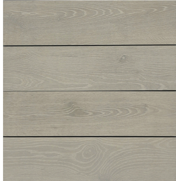
LIGHT GRAY RB13