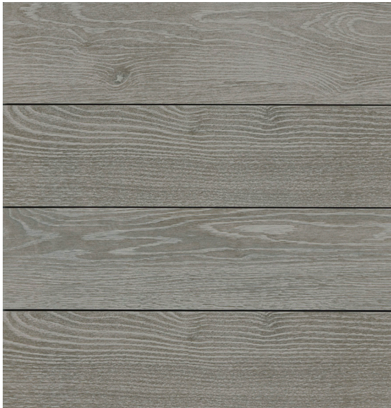
MEDIUM GRAY RB12