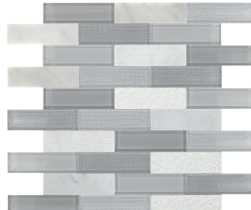
GLASS & MARBLE STORMY MIST SK15