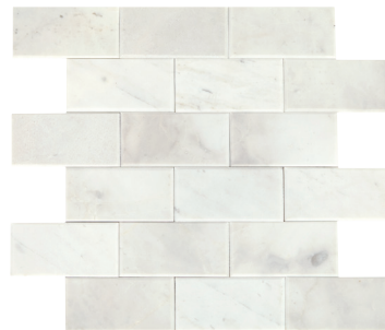
MARBLE STORMY MIST M048