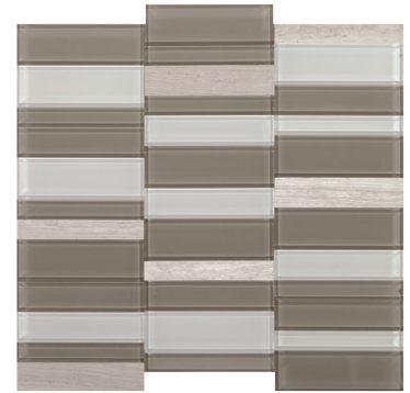
GLASS & LIMESTONE CHENILLE WHITE SK13