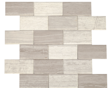
GLASS & LIMESTONE CHENILLE WHITE L191

* Unique Simplystick installation method. Refer to the Simplystick Mosaix installation instructions for details.