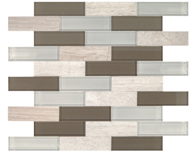
GLASS & LIMESTONE CHENILLE WHITE SK17