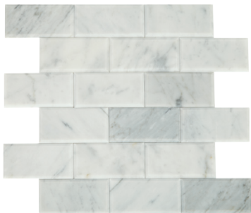
MARBLE WHITE CARRARA M701