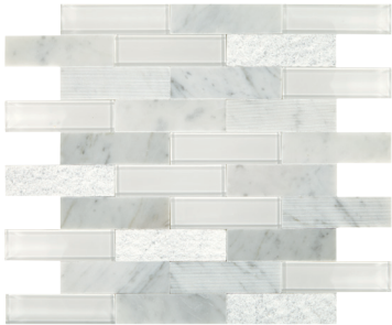
GLASS & MARBLE WHITE CARRARA SK16