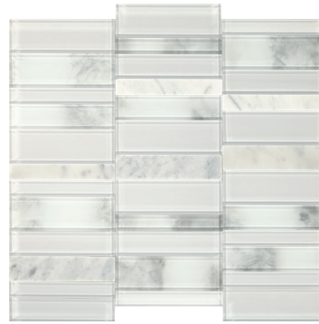
GLASS & MARBLE STORMY MIST SK11