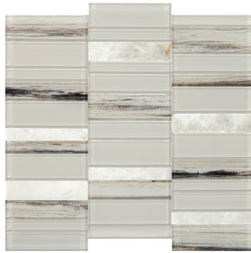
GLASS & MARBLE DAPHNE WHITE SK10