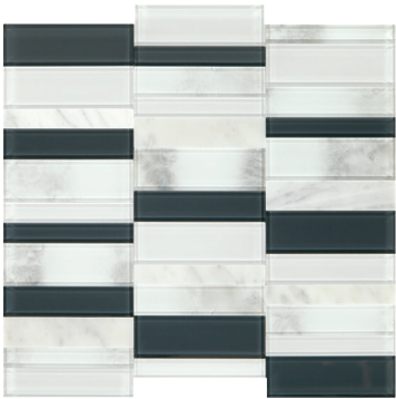
GLASS & MARBLE WHITE CARRARA SK12