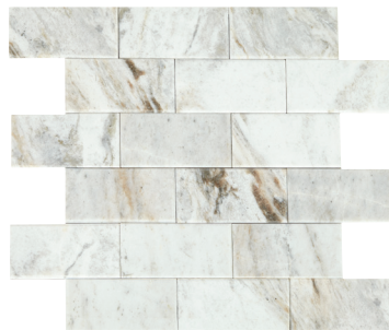
MARBLE DAPHNE WHITE M103