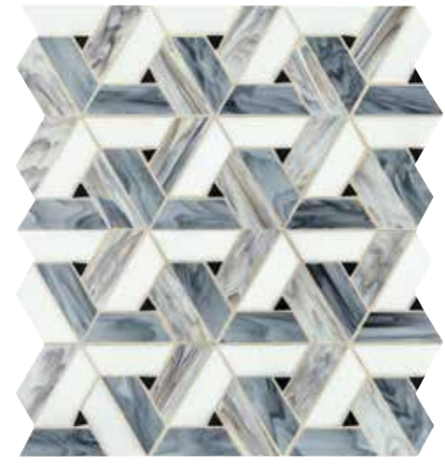
SPECTRA BLUE VF03