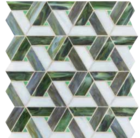
ENCHANTED GREEN VF02