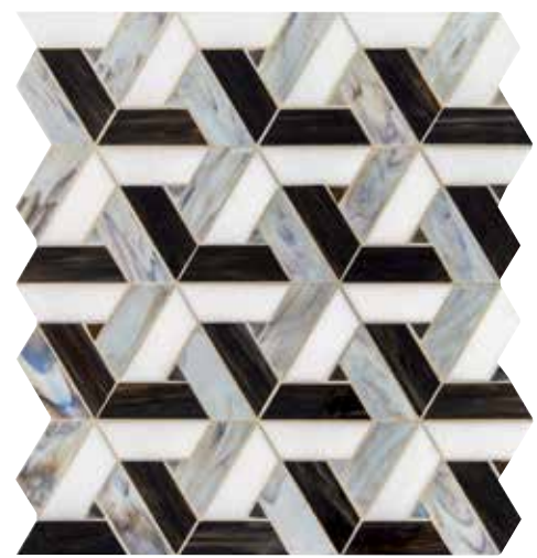
MIDNIGHT DREAM VF06