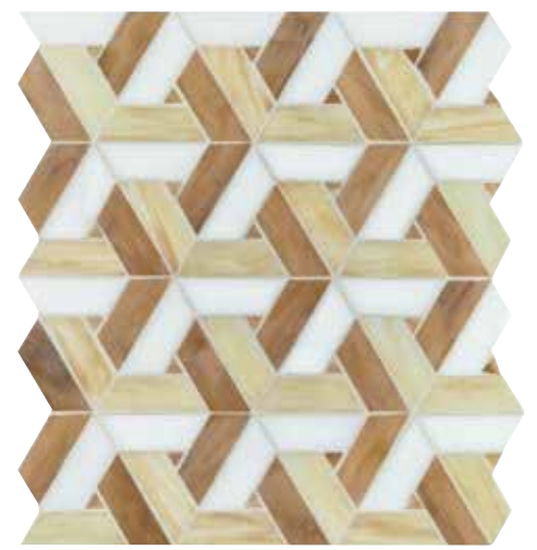
HEIRLOOM GOLD VF05