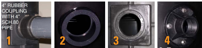
4" RUBBER COUPLING WITH 4" SCH.80 PIPE