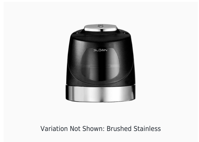
Variation Not Shown: Brushed Stainless