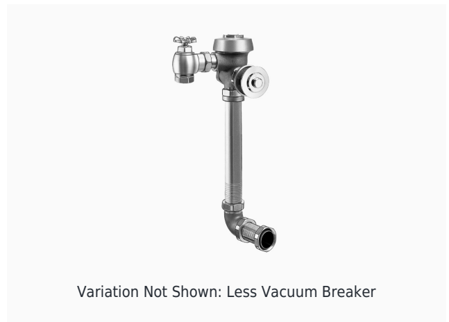
Variation Not Shown: Less Vacuum Breaker