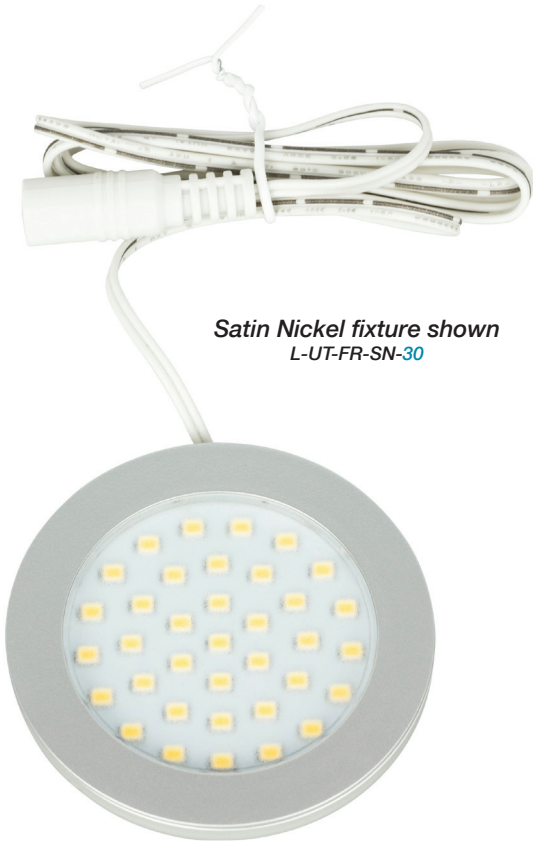
Satin Nickel fixture shown L-UT-FR-SN-30